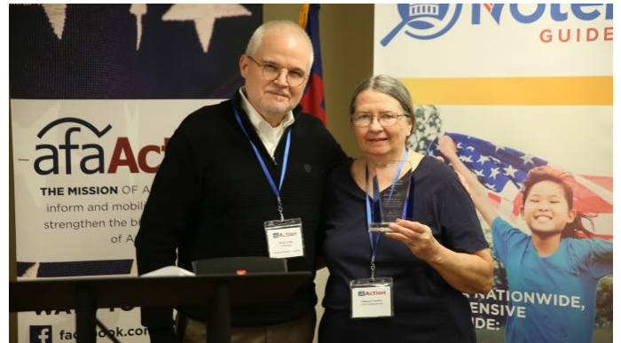
AFA of PA President and Dr. Alan Keyes spoke at an event in Erie on April 29, 2022.